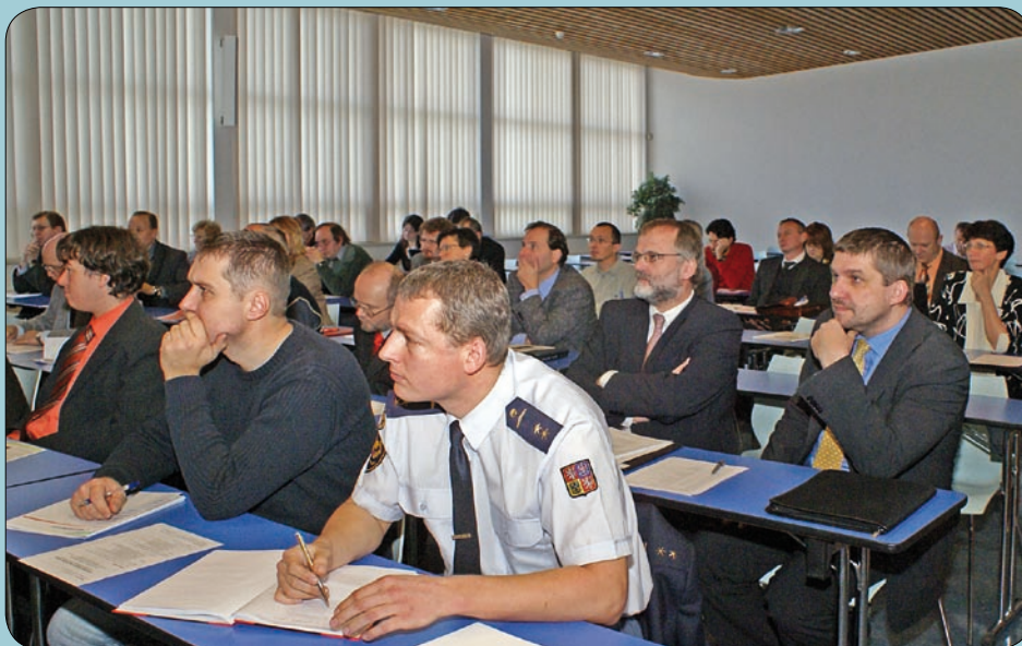
At the seminar Uniform Digital Technical Maps (2008)

Nemoforum events are held usually in the conference hall in the building of Surveying and Cadastral Offices in Prague 8 – Kobylisy and they enjoy substantial interest of professional public. The program and presentations from Nemoforum events are available on the website of the association. As a partner or co-organizer, Nemoforum supports also other events organised by member institutions on selected topics in accordance with the Nemoforum business plan.