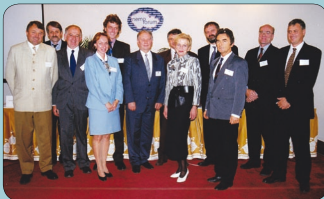
Representatives of member organizations in 1999

The following list of Nemoforum members shows main professional topics of each organization within Nemoforum and the names of their representatives in the Plenum.